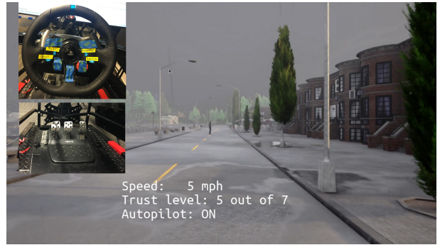
Fig. 3: Driving simulator setup.

The vehicle started driving in autopilot mode. When the vehicle approached an incident, the participants can decide whether to take over the vehicle to handle the incidents on the road. Should the participant choose not to take over, the vehicle will remain in autopilot mode to handle the incident. At any point during the experiment, the participant has the option to assume control of the vehicle and switch to manual driving. Should the participant choose to take over, he/she was required to switch back to autopilot mode before arriving at the next intersection so that the vehicle can choose the next direction to go. We asked the participants to periodically record their trust in the AV using the buttons